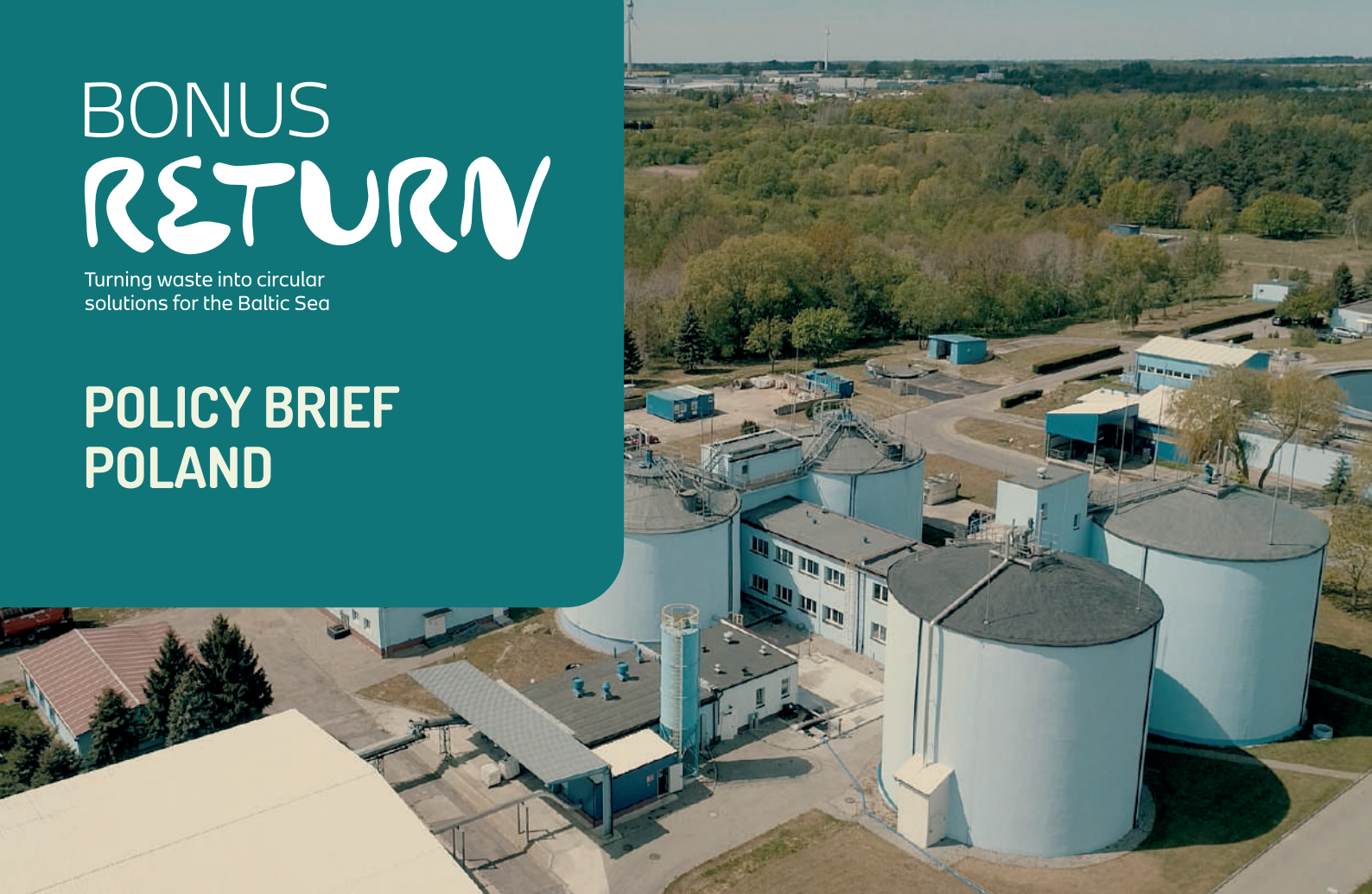
Aerial view of the Słupsk Waterworks wastewater treatment plant in Poland.